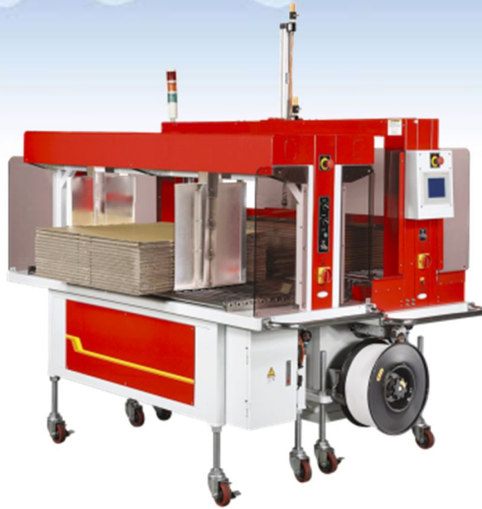
TP-701CCQ Corrugated Strapper with Bundle Squarer