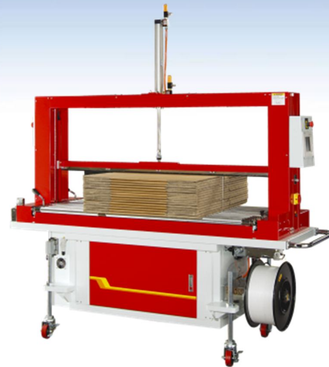
TP-701CC Corrugated Strapper